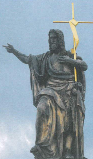
Statue of St John the Baptist on the Charles Bridge in Prague, Czech Republic

John the Baptist is the major figure in this year's Advent Gospel readings. Today's passage is the beginning of Luke's account of the ministry of Jesus, and John the Baptist appears at this point in all four evangelists' versions.