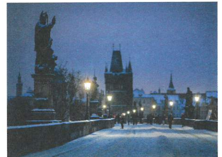
The statue of Augustine of Hippo on the Charles Bridge in Prague

A mystery is a truth of our faith that we can explore, but never fully understand.