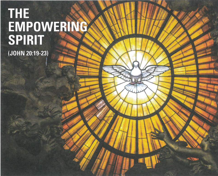
"Dove of the Holy Spirit" at Throne of St Peter by Bernini (1600s) in St Peter's Basilica, Rome

The miraculous appearance of Jesus among the disciples in a locked room shows that he is no longer constrained by physical limitations.