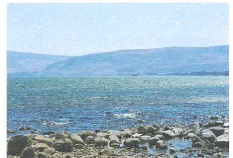
View of the Sea of Galilee from the shore

Disciples normally chose to follow the rabbi whose teachings and way of life impressed them: Jesus is unusual in selecting his disciples.